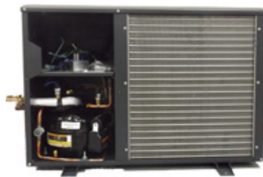
DS025/WGS40 Condensing unit with easy-access cover

*Condensing unit is patented US Patent No. D791294 EU Patent No. 003189349-0001