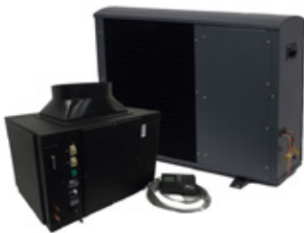
Wine Guardian Evaporator (L) and condensing unit (R) (DS025, WGS40 only)

*Condensing unit is patented US Patent No. D791294 EU Patent No. 003189349-0001