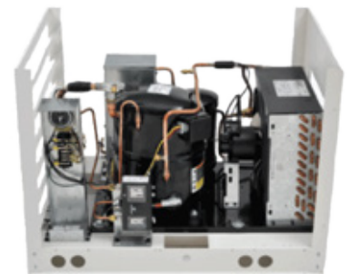
SS050, SS088, SS200, WGS100, WGS175 Condensing unit with easy-access cover

Wine Guardian USA: 1 (800) 825 3268 | 1 (315) 452 7400 wineguardian.com | info@wineguardian.com