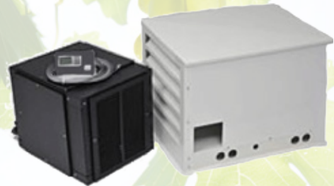
Fan coil unit (Left) and outdoor condensing unit (Right) (SS050, SS088, SS200, WGS100, WGS175 only)