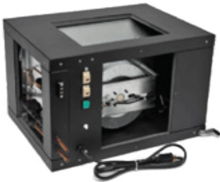
Removable cover panel for easy access