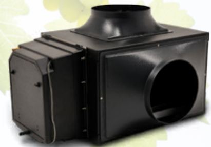
Ducted split system with optional, integrated humidifier